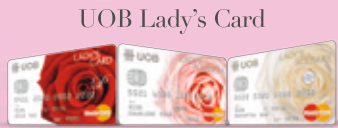
UOB Lady's Card

Terms and Conditions apply. All privileges are valid at Asia's Dining Destination's participating dining establishments only.